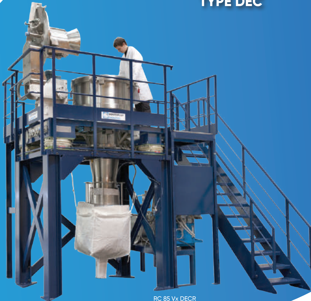
RC 85 Vx DECR